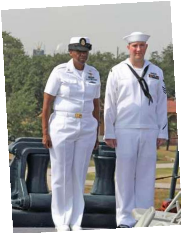
Below – Enlisted Sailors of the Year from the USS San Jacinto