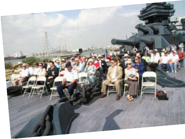
Below – Audience on the Battleship Texas